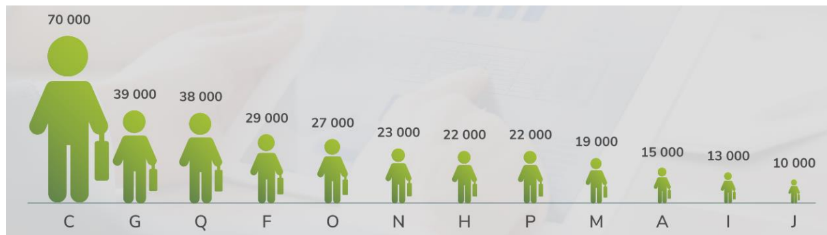
Figure 12: Forecast of the total additional need of labour in the period 2020 - 2025 in the Slovak Republic in sectors of the economy (only the sectors with the highest additional need are shown) - The value represents the number of people

C – Industry; G - Wholesale and retail; Q - Health and social assistance; F – Construction; O - Public administration and defence; N - Administrative and support services; H – Transport and logistics; P - Education; M - Expert, scientific and technical activities; A - Agriculture, forestry and fishing; I - Accommodation and food services; J - Information and telecommunication