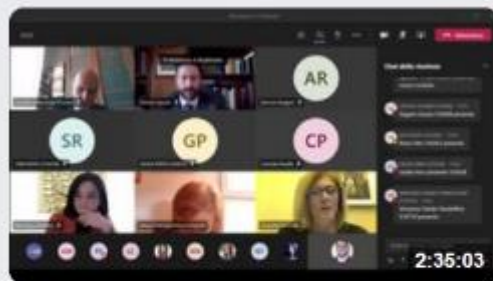
Convegno: "Identità in costruzione: il diritto alla ricerca delle proprie origini"

Dipartimento di Giurisprudenza Unime Visualizzazioni: 1111 - 27 novembre 2020