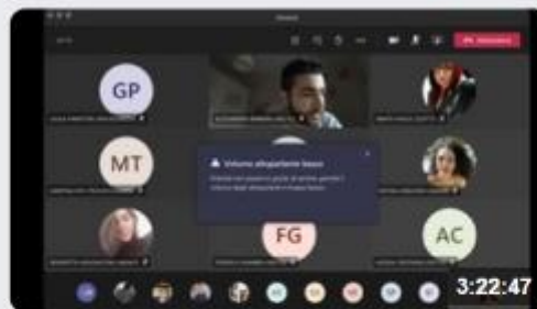
Dipartimento di Giurisprudenza Unime Visualizzazioni: 1174 - 25 novembre 2020

Dipartimento di Giurisprudenza Unime Visualizzazioni: 1111 - 27 novembre 2020