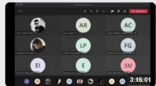
Doppia pregiudizialità Dipartimento di Giurisprudenza Unime Visualizzazioni: 1949 - 23 novembre 2020