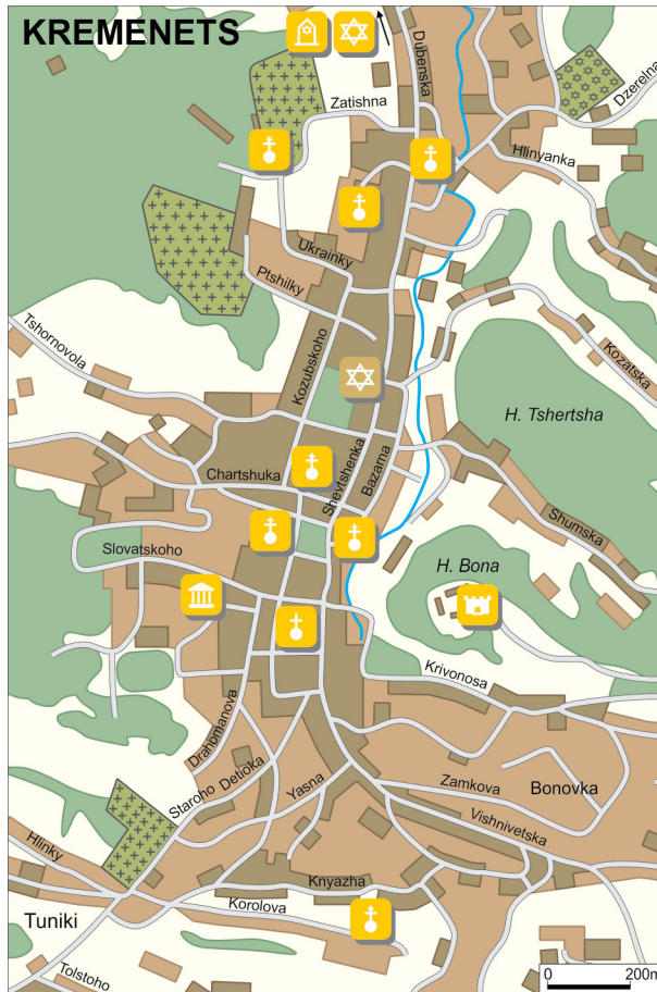
Fig. 2. Kremenets (Ukraine) 1:20,000 – town map designed for the Shtetl Routes guidebook (sample)

to choose compromising solution. While all other features are drawn up to date, build-up area is shown at two stages: pre-WW II and current (fig. 1, fig. 2). Cartographic presentation of change adds another dimension (time) to these primarily simple maps, giving them a new, deeper meaning (M.-J. Kraak, F. Ormeling 2010, B. Szady 2008). Despite the fact that this methodological solution is not innovative itself, there are only a few similar cartographic products where the presentation of dynamics can be encountered (M. Meksuła 2001).