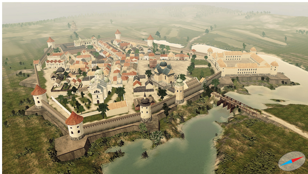
Fig. 5. Zhovkva XVIII (Ukraine) – Shtetl Routes 3D mock-up (sample)

LoD 3 models are used to present unique buildings. The combination of LoD 2 and LoD 3 buildings placed on large-scale map or textured Digital Terrain Model filled with 3D models of trees created attractive mock-ups (fig. 4). The addition of effects of sunlight, shadows, fog, cloudy sky and (in some cases) even shiny water with reflections of objects in model teasers rendering, makes Shtetl Routes mock-ups a digital masterpiece (fig. 5).