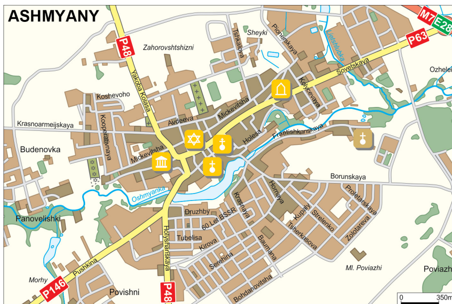
Fig. 1. Ashmyany (Belarus) 1:35,000 – town map designed for the Shtetl Routes guidebook (sample)

in 15 categories: 5 categories referred strictly to Jewish heritage, 5 categories referred to sacral objects of Christianity (Latin or Orthodox) and Islam, other categories included secular features. Preservation status was coded with Boolean: 1 – “preserved”, 0 – “not preserved”. Comments like “active”, “closed”, “rebuild”, “in ruins”, “changed usage” were added to records with “true” values. GIS database served as a foundation for designing maps (J. Kuna 2015a). Along with the development of the project, the idea of designing online, interactive map was mentioned. Unfortunately, it had to be postponed due to the rigid budget.