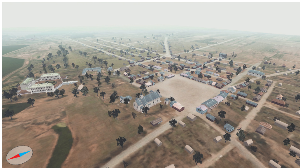
Fig. 4. Kock 1930s (Poland) – Shtetl Routes 3D mock-up (sample)

Maps and plans names translated on the basis of: Kuncewicz A., 1929: Plany przeglądowe miast polskich and Lewandowska M., Stelmach M., 1996: Plany miast w polskich archiwach państwowych – katalog