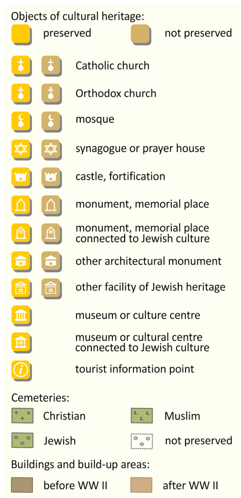
Fig. 3. The common legend for all 63 town maps in the Shtetl Routes guidebook (thematic features only)

changed. Experience of field researchers was the key. With such a diversity of signatures the legend was needed, but there was no possibility to place the legend within limited size of maps. Expecting random placement of maps throughout the guidebook, authors came with an idea that printing legend at an external part of the cover (that would fold in and out) would be useful.