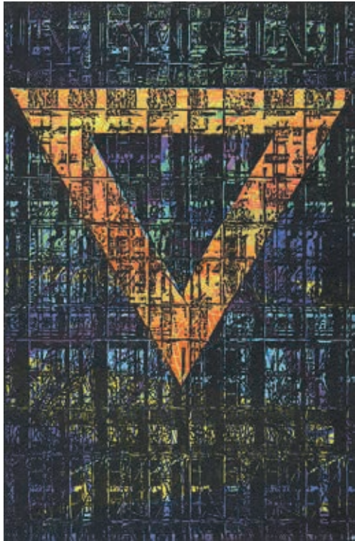
RENATA GOGOL, Poland, Present, 2018, Linocut, Digital Background, 12x7,8 cm