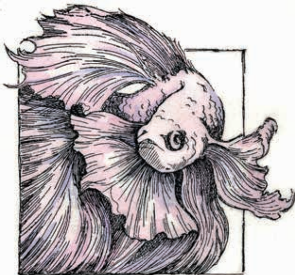
HANNA POPRUHA, Ukraine, Aquarium II, 2018, Etching, Watercolor, 10x10 cm