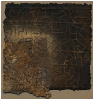
Assonance I, 2018, Head made paper, Linocut, Metal, 15x15 cm