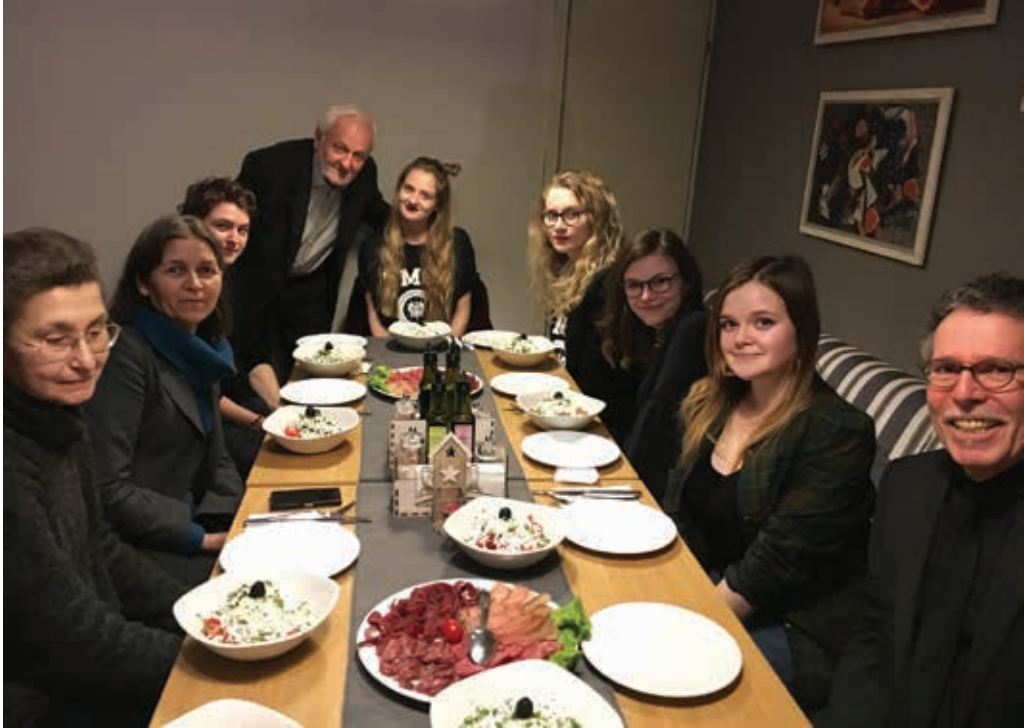
Dinner with visiting artists after the opening reception in restaurant TOHUN