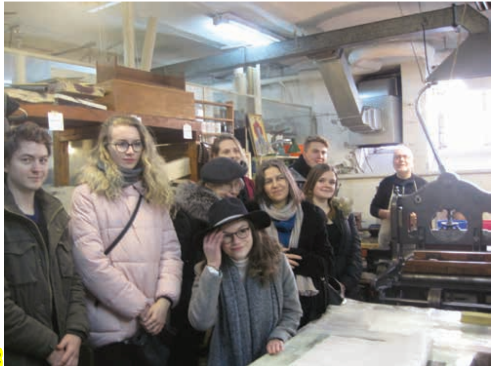
Visiting artists in the Printmaking studio of the Art Academy