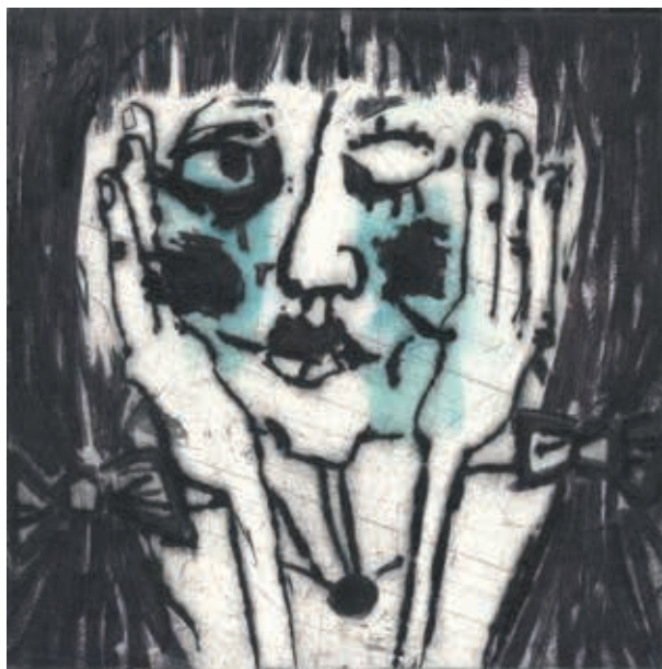
KATARZYNA WOLCZYŃSKA, Poland, HEAR-NO-EVIL KID, 2018, Dry Point, Digital Background, 12x12 cm