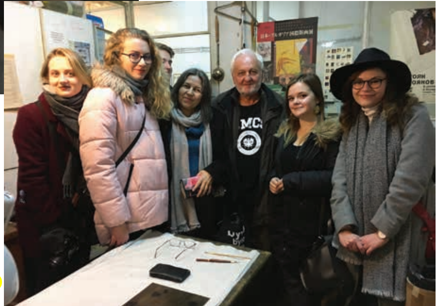
Visiting artists in the printmaking studio of the Art Academy