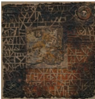
Assonance II, 2018, Head made paper, Linocut, Metal, 15x15 cm