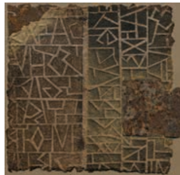
Assonance III, 2018, Head made paper, Linocut, Metal, 15x15 cm