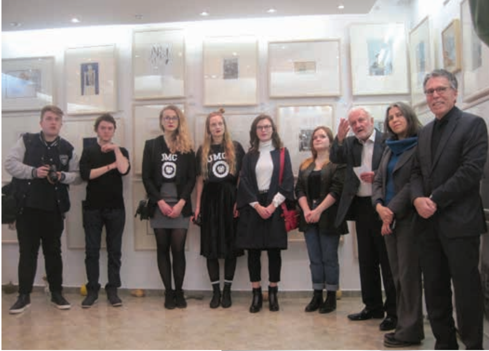
The Jury announcing the Prize Winners