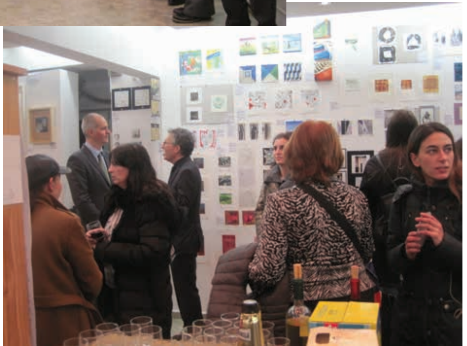
Opening reception - visitors